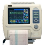
Vital Sign Monitors