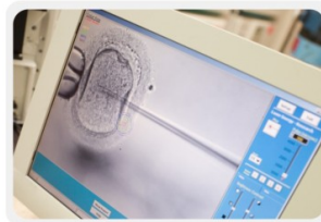
Safety & Inspections