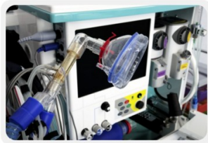
Respiratory Therapy Equipment